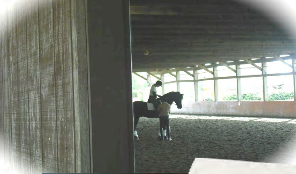
DOVE HOLLOW DRESSAGE CENTER